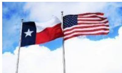
MADE IN TEXAS, U.S.A.