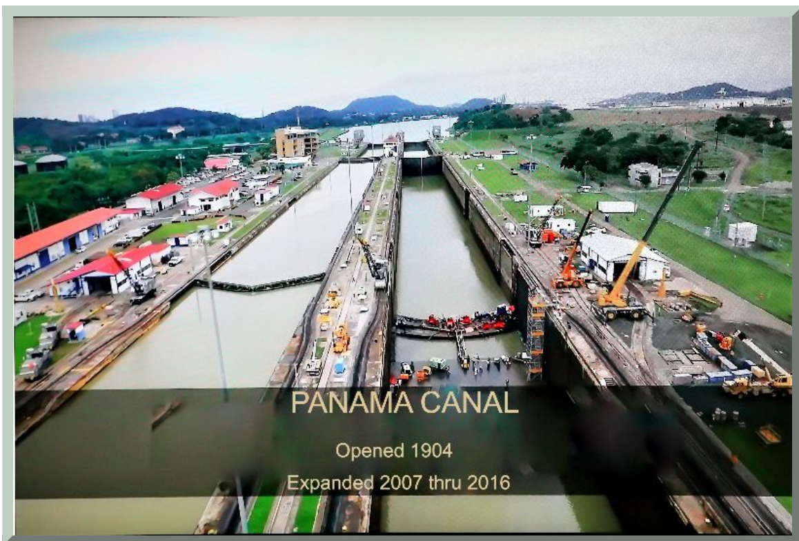
PANAMA CANAL Miraflores Lock